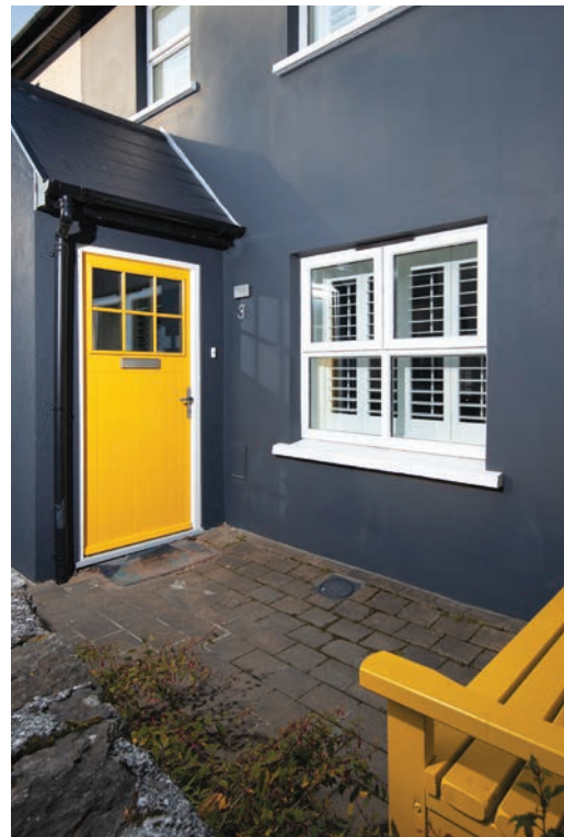
CORNFIELD Door & Bench

TOP TIP MATCH YOUR SIDE GATE TO YOUR FRONT DOOR