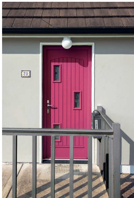
RASPBERRY LANE Door