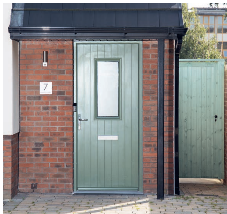
URBAN SLATE Wooden Fence From Cuprinol Garden Shades