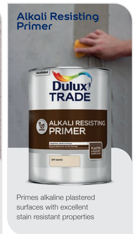
Alkali Resisting Primer

Seals powdery and chalky surfaces to give base for masonry paint